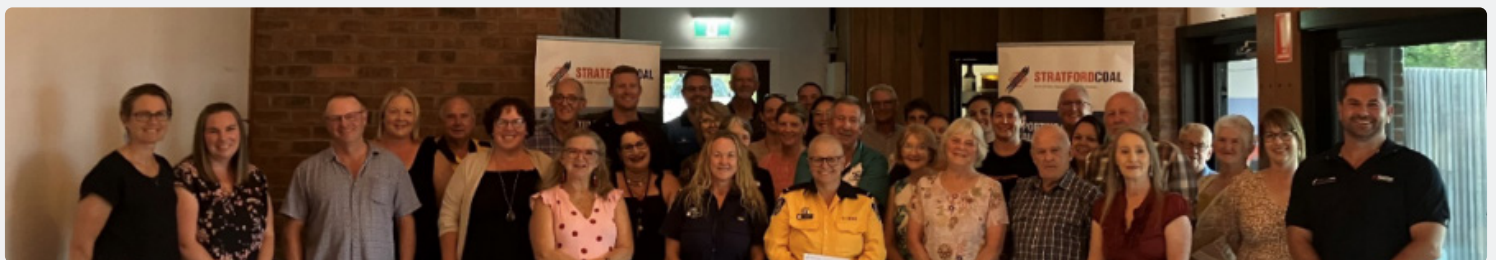
2024 Community Support Program Recipients